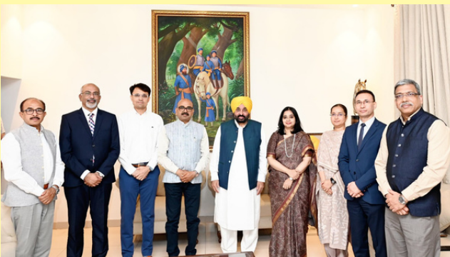
Punjab Chief Minister Bhagwant Mann met Indian Foreign Service (IFS) officials; Called for action to establish Punjab as a prime investment destination