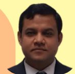
Amit Kumar Mishra Director MEA

“India’s DPI represents a unique convergence of innovation, governance, and scale. As the world looks for models that are inclusive, scalable, and values-driven, India can offer DPI as its strategic contribution to global development. By integrating DPI into its foreign policy and economic diplomacy, India can foster long-term partnerships, secure new markets, and build a powerful digital brand. DPI is not just infrastructure — it is a platform for 21st-century diplomacy, growth, and global leadership. Digital infrastructure is as crucial as building physical infrastructure abroad, and perhaps may overtake such goals in the near future, especially in the Global South. As we extend DPI Diplomacy, equipping our teams abroad will go a long way in projecting India as a tech leader as well as in institutionalising DPI in Multilateral Diplomacy.”