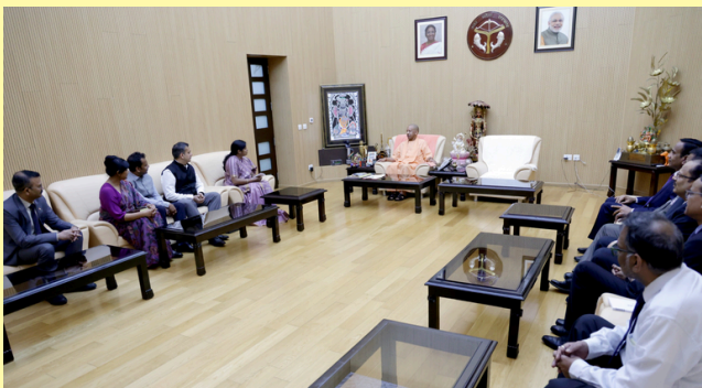
Ten officers of the Indian Foreign Service of 2009 Batch, paid a courtesy visit to Governor on 23 April and on Chief Minister in Lucknow on 24 April.