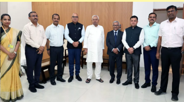
Six IFS officers, MCTP II participants, having state attachment in Bihar called on the Governor on 21 April and on the Chief Minister on 25 April