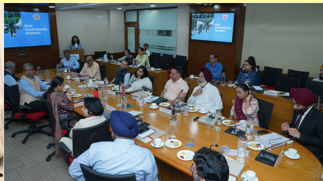
Collaborative dialogue between IFS officers (2009 Batch) and university representatives of the State of Punjab, exploring opportunities for academic and diplomatic advancements ) with the State of Punjab on 23rd April, 2025.