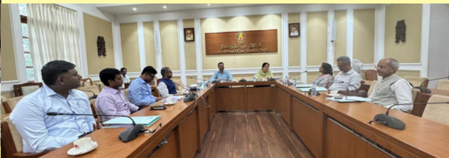
State Attachment in Tamilnadu