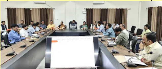
Visit to Aspirational District Chandauli in Uttar Pradesh by MCTP II participants.